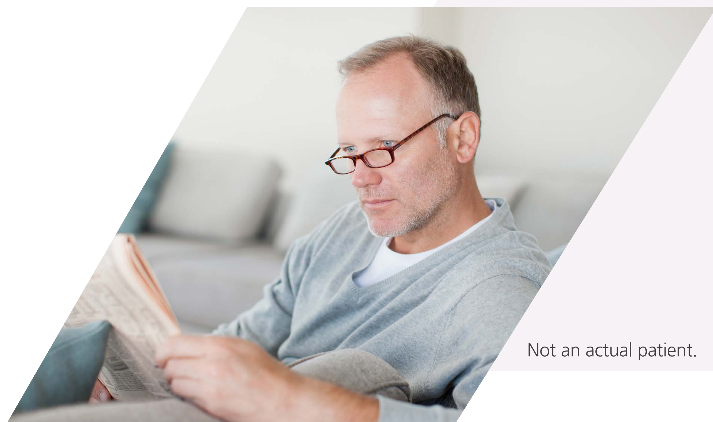
Not an actual patient.

panzyga ® Immune Globulin Intravenous (Human) - ifas 10% Liquid Preparation