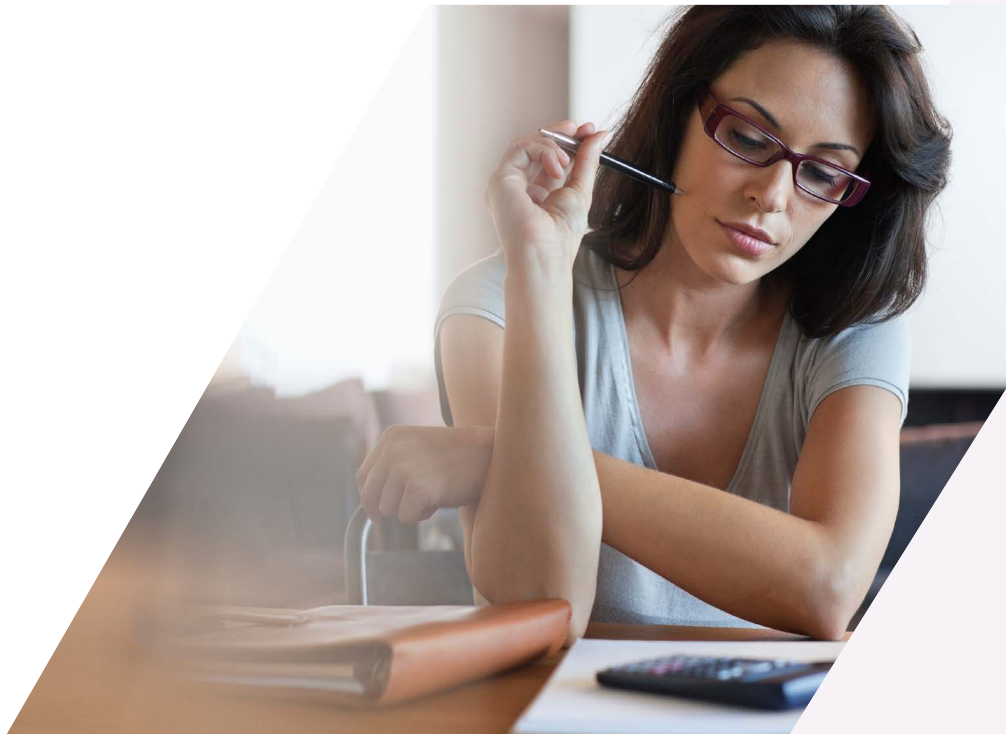
Not an actual patient.